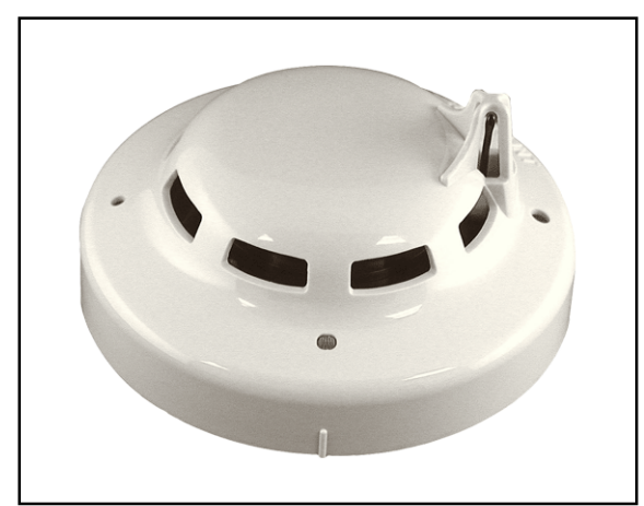
Shown without base