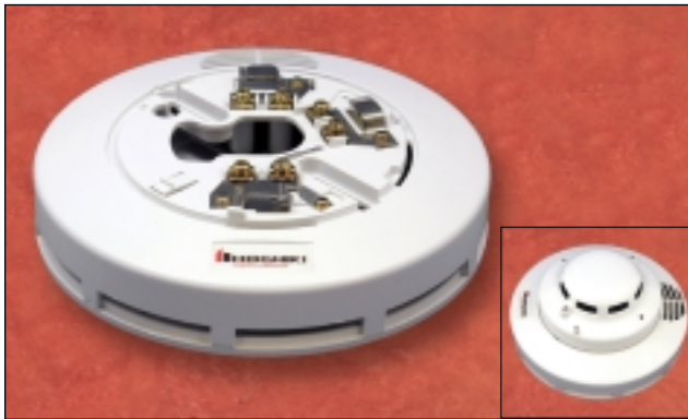
Shown with detector