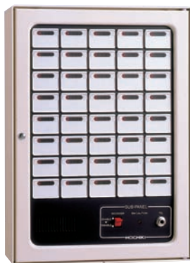
PEX-5G to 40G