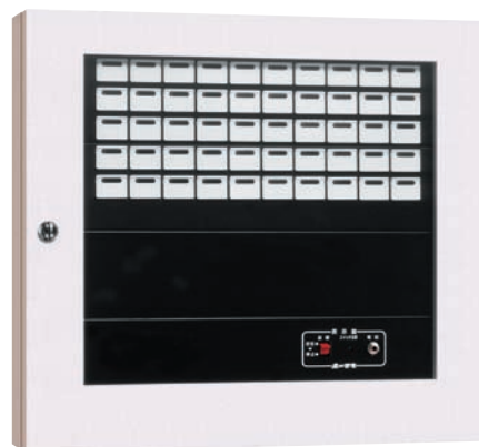
PEX-50G to 210G